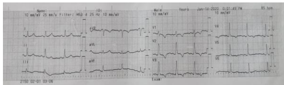
Figure 2: ECG (after 3 months)

We kept her on follow-up and after 3 months her ECG (as illustrated in Figure 2) showed normalization of QT interval and resolution of T-wave inversion in lead II & aVF and resolution of deep T-wave inversions in anterior leads. Her echocardiogram was repeated which showed normal LV function LVEF of 55% and complete resolution of segmental wall motion abnormality and MR.