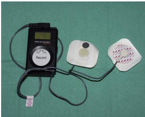
Figure 5: External Loop Recorder

In a country like Pakistan where there are limited resources, diagnosis and management of arrhythmias still has a long way to go. This article sheds light on the need of utilizing the recommended available devices.