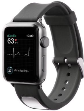
Figure 1: FDA Approved Apple Smart Watch

definitive diagnosis is necessary to ensure patients well-being.