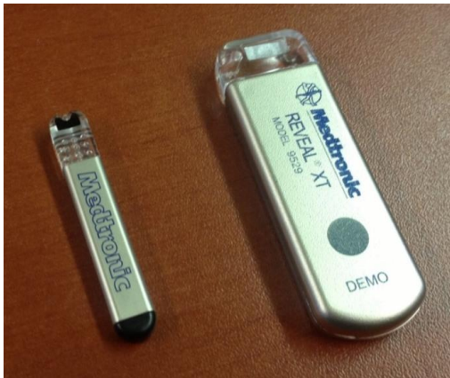
Figure 4: Implantable Cardiac Monitor

case the initial investigation was inconclusive, the physician would still repeat the same investigation. 3