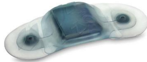
Figure 4: Implantable Cardiac Monitor

The advent of smart phones has added endless potential for recording through wireless Bluetooth transmission. Smart devices like the OMSHIRT tm have the added advantage of being comfortable to wear. Newer devices for example Cardiostat has been shown to offer equal quality tracings when compared to standard Holter monitoring, often up to the 99% sensitivity and specificity through better designed R wave (QRS) detection algorithms. 7,8 Studies have shown these newer devices to be easily operable and can even be mailed to patients homes for self-attachment with an equal efficacy to hospital applied machine. 6