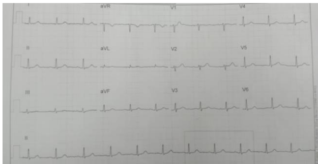
Figure 2: ECG showing a normal sinus rhythm